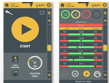
New easy to use touch screen operator interface.