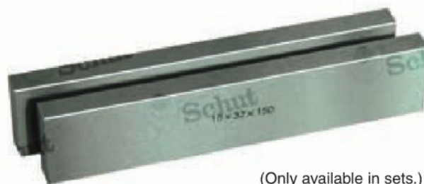
(Only available in sets.)